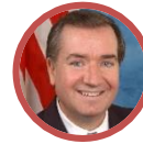
Ed Royce (even) (R-CA39)