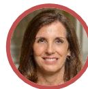
Martha McSally (R+1) (R-AZ02)*