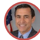
Darrell Issa (R+1) (R-CA49)