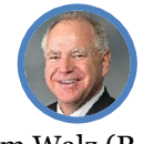
Tim Walz (R+5) (D-MN01)*