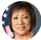
Colleen Hanabusa (+17) (D-HI01)*