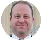
Jared Polis (+9) (D-CO02)*