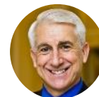
Dave Reichert (even) (R-WA08)