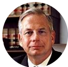
Gene Green (+19) (D-TX29)