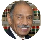
John Conyers (+32) (D-MI13)