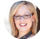
Kyrsten Sinema (+4) (D-AZ09)*