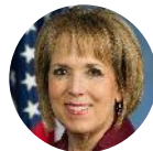
Michelle Lujan Grisham (+7) (D-NM01)*