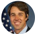
Beto O'Rourke (+17) (D-TX16)*