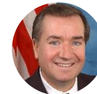
Ed Royce (even) (R-CA39)