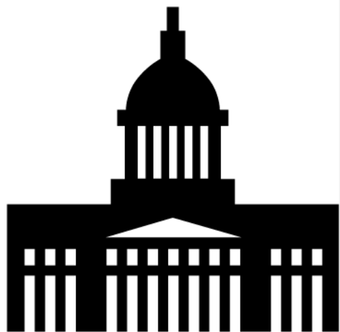
House of Representatives