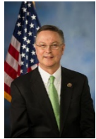
Rod Blum (R-IA)