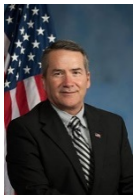
Jody Hice (R-GA)