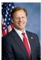
David Brat (R-VA)