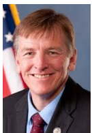
Paul Gosar (R-AZ)