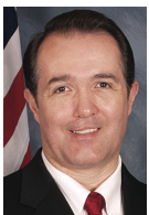
Trent Franks (R-AZ)