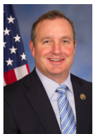
Jeff Duncan (R-SC)