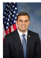
Justin Amash (R-MI)