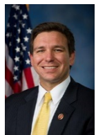
Ron DeSantis (R-FL)