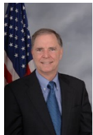
Bill Posey (R-IN)