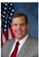
Jim Bridenstine (R-OK)