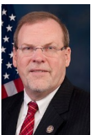
Morgan Griffith (R-VA)