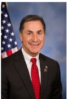
Gary Palmer (R-AL)