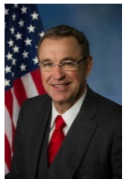
Matthew Salmon (R-AZ)