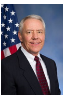
Ken Buck (R-CO)