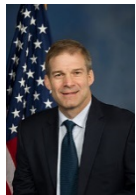
Jim Jordan (R-OH)