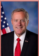
Mark Meadows (R-NC)