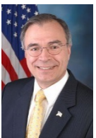
Andy Harris (R-MD)