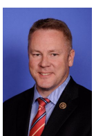
Warren Davidson (R-CO)