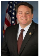
Alex Mooney (R-WV)