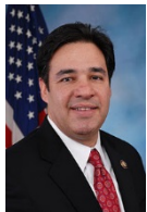
Raul Labrador (R-ID)