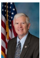
Mo Brooks (R-AL)