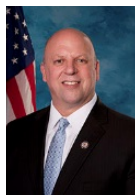
Scott DesJarlais (R-TN)