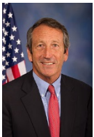
Mark Sanford (R-SC)