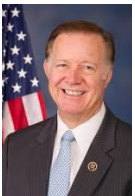
Randy Weber (R-TX)