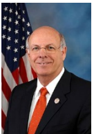
Steve Pearce (R-NM)