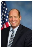
Ted Yoho (R-FL)