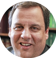
Chris Christie (R) Elected 2009