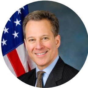
Eric Schneiderman Attorney General, New York