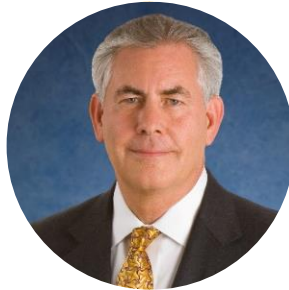
Rex Tillerson Secretary of State