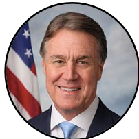
David Purdue Senator from Georgia (R)