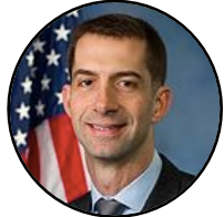
Tom Cotton Senator from Arkansas (R)