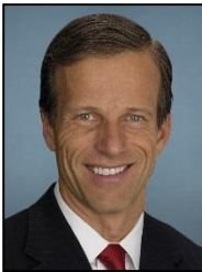
3. John Thune (SD) Conference Chair