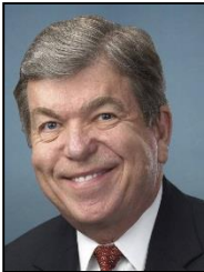
5. Roy Blunt (NC) Conference Vice Chair