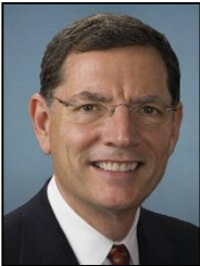
4. John Barasso (WY) Policy Committee Chair