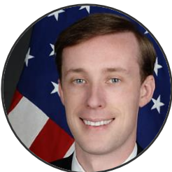
Jake Sullivan National Security Advisor to the Vice President

Burns holds the title of the first African-American woman to head a Fortune 500 company. She is expected to leave her post in 2017. Burns is a Clinton donor and has experience in corporate America beyond Xerox which prepares her for a position like commerce secretary in the Clinton Administration.