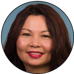
Tammy Duckworth Representative for Illinois

Duckworth is an Iraq War veteran who lost both legs when her helicopter was hit by a rocket-propelled grenade. After returning from combat, she served as a representative from Illinois and was assistant secretary of the VA Department during Obama's first term. A woman has yet to head either the Department of Defense or VA. Duckworth has the necessary credentials to fill either roll.