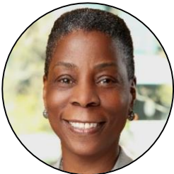
Ursula Burns Chief Executive Officer of Xerox

Duckworth is an Iraq War veteran who lost both legs when her helicopter was hit by a rocket-propelled grenade. After returning from combat, she served as a representative from Illinois and was assistant secretary of the VA Department during Obama's first term. A woman has yet to head either the Department of Defense or VA. Duckworth has the necessary credentials to fill either roll.