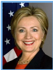
Dem. Nominee Hillary Clinton

Drug prices have been a major topic of discussion in the presidential election. Clinton, Trump and Sanders all targeted rising drug prices in their platforms. Sanders has since dropped out, but tweeted his disapproval of Mylan’s practices. Hillary denounced Mylan on the campaign trail. Trump has not issued a statement