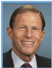
Senator Richard Blumenthal (D-CT)