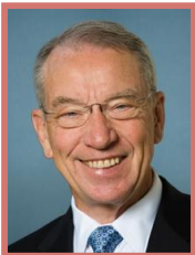
Senator Charles Grassley (R-IA)