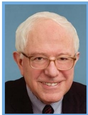
Senator Bernie Sanders (D-VT)