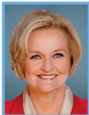
Senator Claire McCaskill (D-MO)