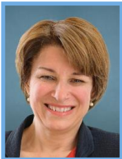
Senator Amy Klobuchar (D-MN)