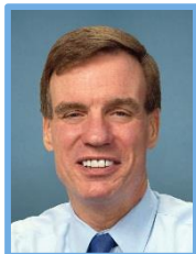
Senator Mark Warner (D-VA)