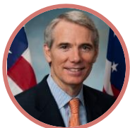
Rob Portman (R-OH) $234,130