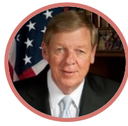
Johnny Isakson (R-GA) $160,450