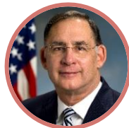
John Boozman (R-AR) $139,500