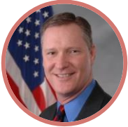
Steve Stivers (R-OH) $136,350