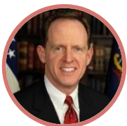
Pat Toomey (R-PA) $387,350