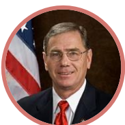
Blaine Luetkemeyer (R-MO) $204,350