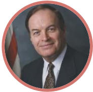
Richard Shelby (R-AL) $430,671