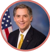
French Hill (R-AR) $158,975