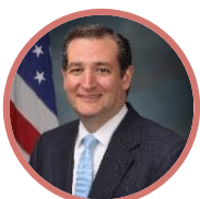
Ted Cruz (R-TX) $372,895