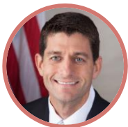
Paul Ryan (R-WI) $284,085