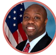
Tim Scott (R-SC) $184,900