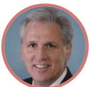
Kevin McCarthy (R-CA) $139,350