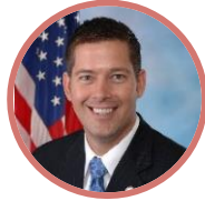
Sean Duffy (R-WI) $129,947