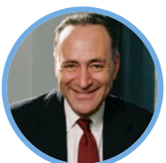
Charles Schumer (D-NY) $230,002