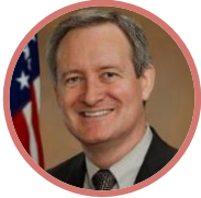
Mike Crapo (R-ID) $205,400