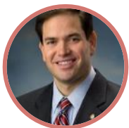
Marco Rubio (R-FL) $244,464