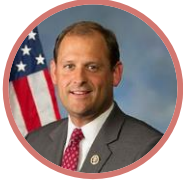
Andy Barr (R-KY) $134,450