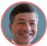
Jeb Hensarling (R-TX) $216,850