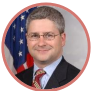
Patrick McHenry (R-NC) $199,800