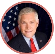
Pete Sessions (R-TX) $123,100