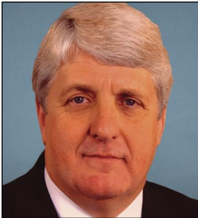
Natural Resources Chairman Rob Bishop (R-UT 1 st District)

“This rule adds another layer of duplicative federal regulation on top of already existing federal and state regulations. The rule oversteps BLM's regulatory jurisdiction, and completely fails to address crucial failures by the BLM to capture methane emissions through common sense methods such as timely right-of-way permitting.”