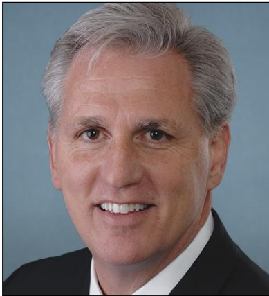
House Majority Leader Kevin McCarthy (R-CA 23 rd District)