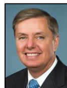
Sen. Graham (R-SC)