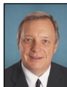
Sen. Durbin (D-IL)