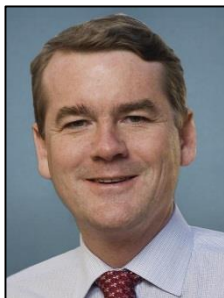
Sen. Michael Bennet (D-CO)