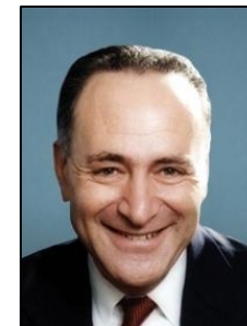
Sen. Chuck Schumer (D-NY)