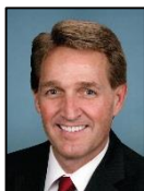
Sen. Flake (R-AZ)