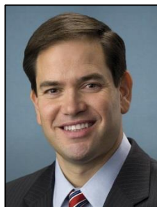
Sen. Marco Rubio (R-FL)