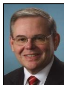
Sen. Menendez (D-NJ)