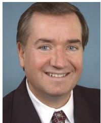
Foreign Affairs Chairman Ed Royce (CA 39 th )