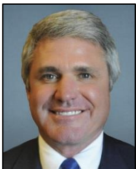
Homeland Security Chairman Michael McCaul (TX 10 th )