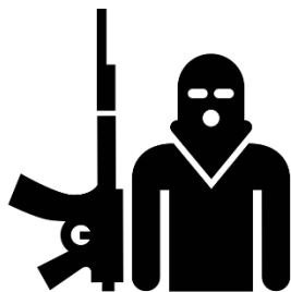
Defeat the Terrorists