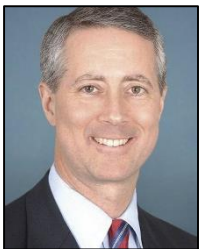
Armed Services Chairman Mac Thornberry (TX 13 th )