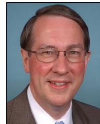
Judiciary Committee Chairman Bob Goodlatte (VA 6 th )