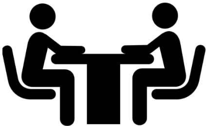
Renew U.S. National Security Tools