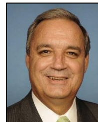
Veterans Affairs Committee Chairman Jeff Miller (FL 1 st )