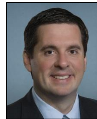
Intelligence Committee Chairman Devin Nunes (CA 22 nd )