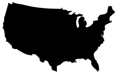
Keep Americans Safe At Home