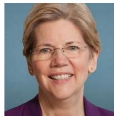
Senator Elizabeth Warren (D)