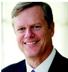
Governor Charlie Baker (R)