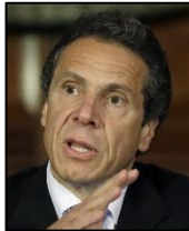
Gov. Andrew Cuomo (NY)

1. Major Elected Officials: These include senators, members of the House, governors and leaders from each state’s Democratic Party.