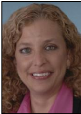
Debbie Wasserman Schultz Chairwoman of the DNC

3. Select Leaders of Organizations Affiliated with the DNC: Members that have been elected to public office for organizations such as the Young Democrats of America (YDA)