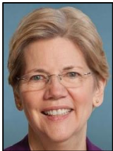
Sen. Elizabeth Warren (MA)