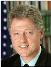
Pres. Bill Clinton

2. Notable Party Figures: These include people such as former and current presidents and vice presidents