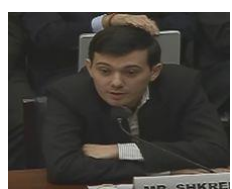
Martin Shkreli Former CEO, Turing Pharmaceuticals LLC