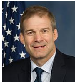
Chairman Jim Jordan (R-OH)