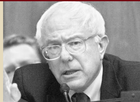
Bernie Sanders, I-Vt. Composite Liberal Score: 93.7