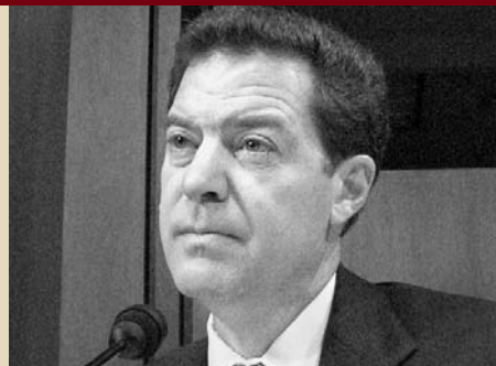
Sam Brownback, R-Kan. Composite Conservative Score: 76.5