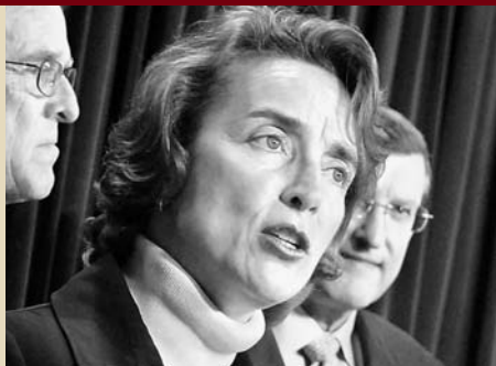
Blanche Lincoln, D-Ark. Composite Liberal Score: 62.3