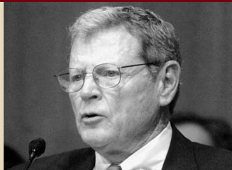
James Inhofe, R-Okla. Composite Conservative Score: 86.7