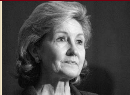
Kay Bailey Hutchison, R-Texas Composite Conservative Score: 75.2