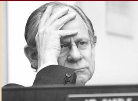
Michael Castle, R-Del. Composite Conservative Score: 53.8