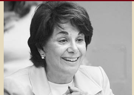
Anna Eshoo, D-Calif. Composite Liberal Score: 77.7