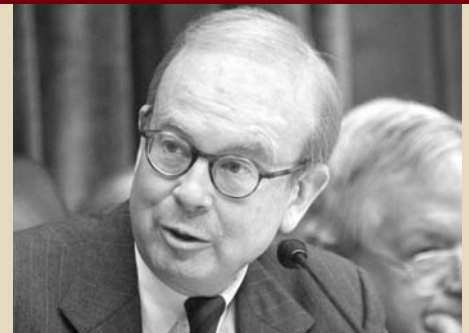
Rick Boucher, D-Va. Composite Liberal Score: 58.3