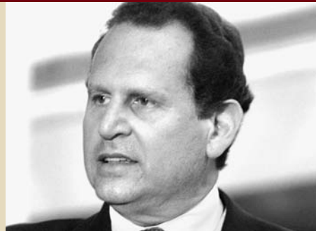
Lincoln Diaz-Balart, R-Fla. Composite Conservative Score: 61.0