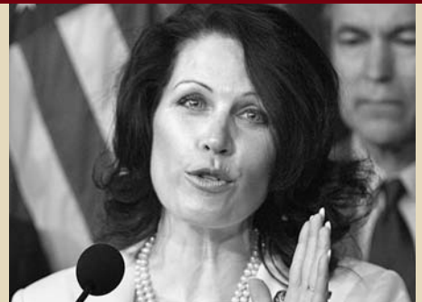
Michele Bachmann, R-Minn. Composite Conservative Score: 89.2