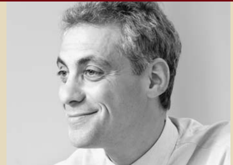
Rahm Emanuel, D-Ill. Composite Liberal Score: 72.3