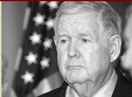
John Murtha, D-Pa. Composite Liberal Score: 61.2