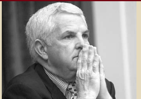
John Shadegg, R-Ariz. Composite Conservative Score: 93.3