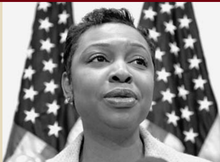
Yvette Clarke, D-N.Y. Composite Liberal Score: 88.7