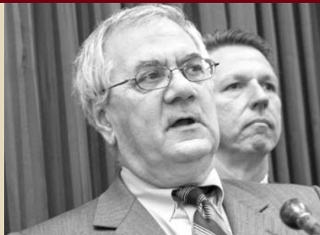
Barney Frank, D-Mass. Composite Liberal Score: 89.7