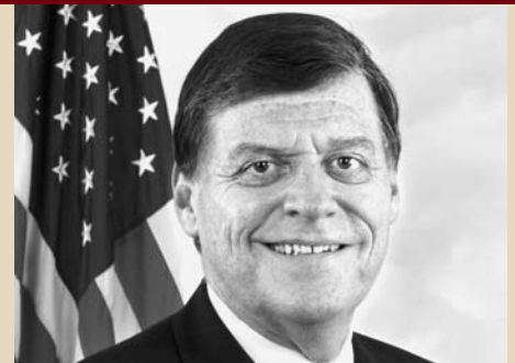
Tom Cole, R-Okla. Composite Conservative Score: 85.2